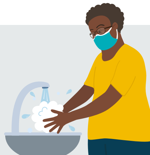
Wash my hands