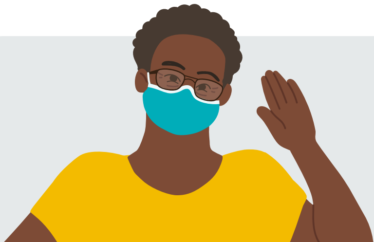
Wear a mask