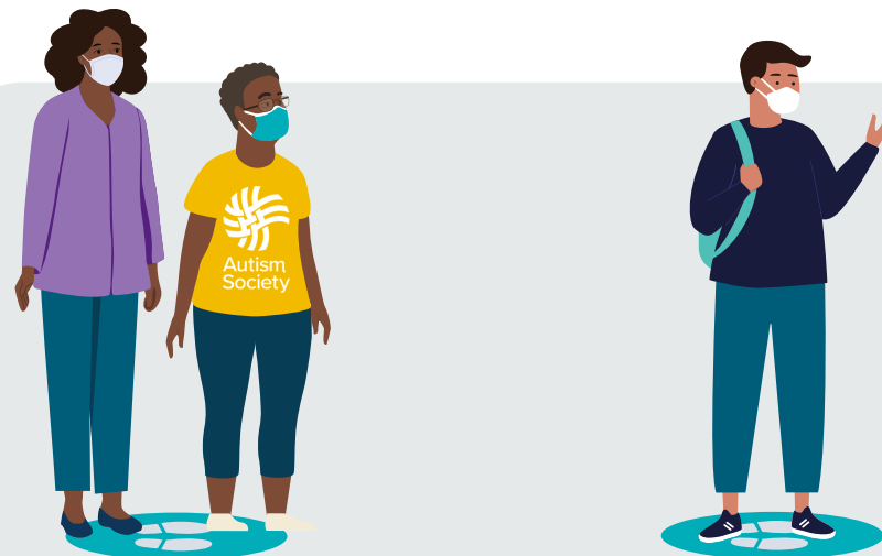
Keep a safe distance from other people