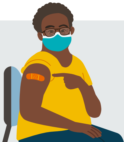
Get a COVID-19 shot